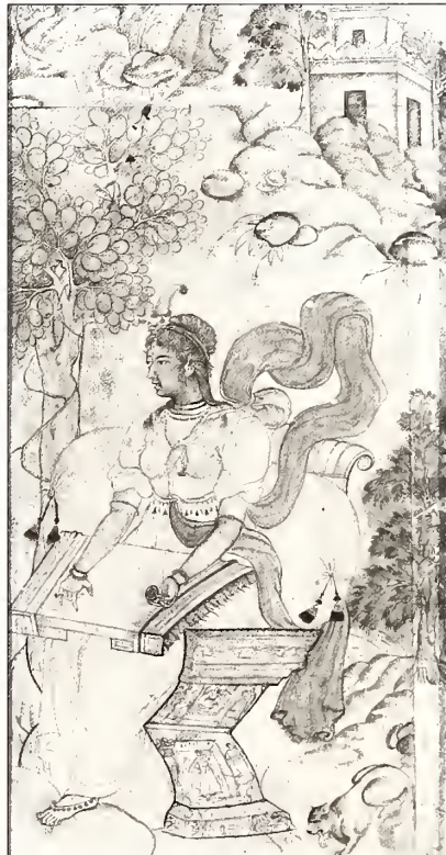
Figure 15. Woman Ploying o Zither , in the style of Basawan, attributable to Husain (act. ca. 1584–98). Mughal school, Akbar period ca. 1585–90. Ink, gold, and watercolor on paper, 14 x 7.3. Arthur M. Sackler Museum, Harvard University Art Museums, Private Collection